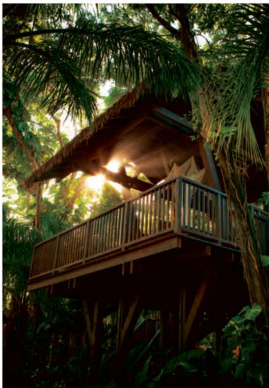
Puerto Rico The Ritz-Carlton Reserve Dorado Beach, a renovation of a 1950s resort, now offers "tree house massages" from its arboreal spa.

Park two hours southwest of London and frequented by the likes of Cate Blanchett, recently expanded its offerings to include a grove of tree house suites. Glide down the long drive past the formal 18th-century home (think Downton Abbey ) and leave your car for a golf cart that will ferry you to the edge of a valley where a dozen suites are built into several buildings rising high above the valley floor. Visitors enter via gangplank to one of the dwellings, ranging in size from a studio, which starts at around $950 per night, to a full tree house, which runs upwards of $2,050 per night. Guests are free to explore the 130-acre property, from the golf course and spa to the Hampshire coast, but many opt to remain reclusive, partaking of the breakfast that arrives in a bright wooden hamper every morning.